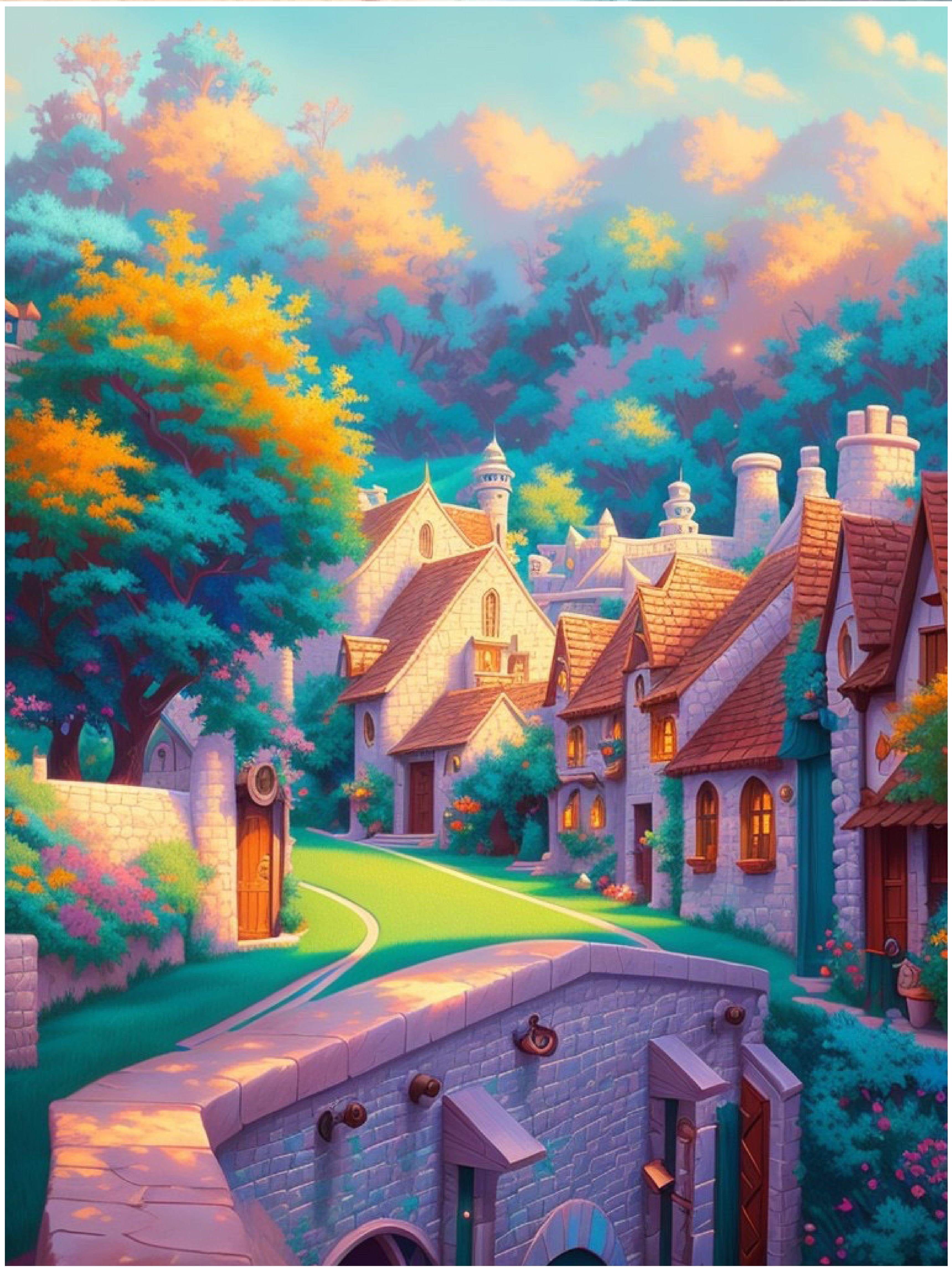
EDGY FOREST DREAM